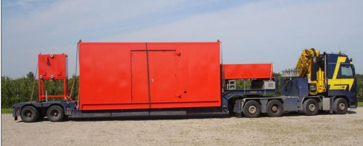
Soundproof offshore container : Supply of a double fire-rated door

FRANCARE has followed up all the manufacturing process, as well as the support for the factory's inspection and supply for the certification of the double fire-rated door (297x267x70cm//1000 kg)