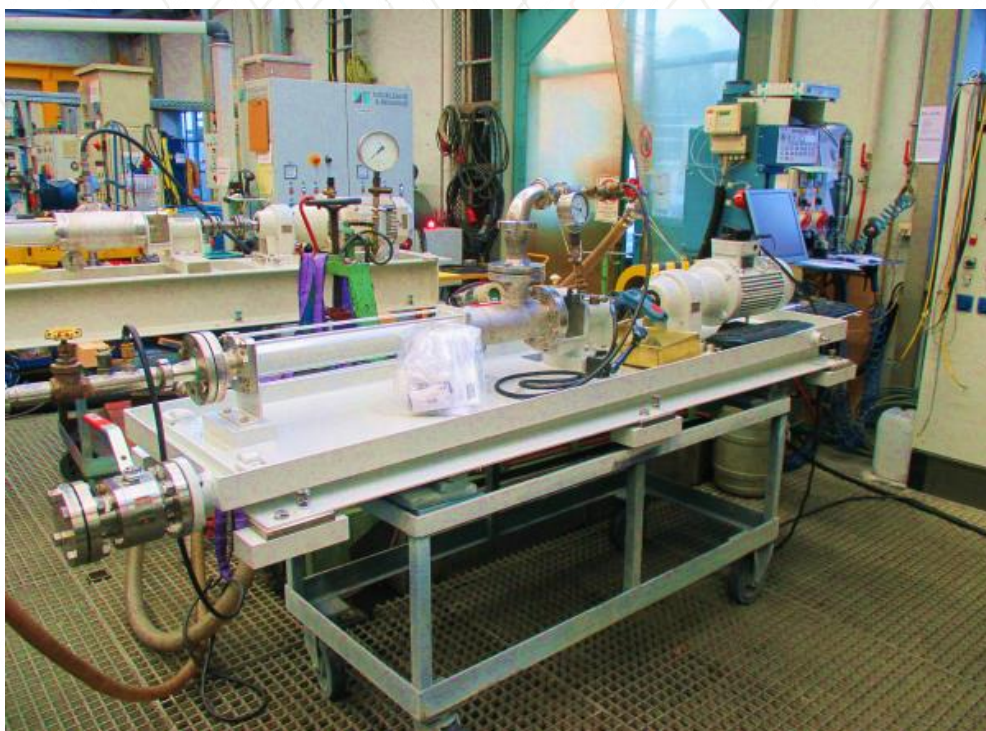
Eccentric screw pump outlet pressure: 27.8 Barg