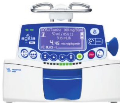
Infusion pump, infusion rate range : from 0,1 to 1500 ml/h. Volume to be infused : from 1 to 9999 ml.