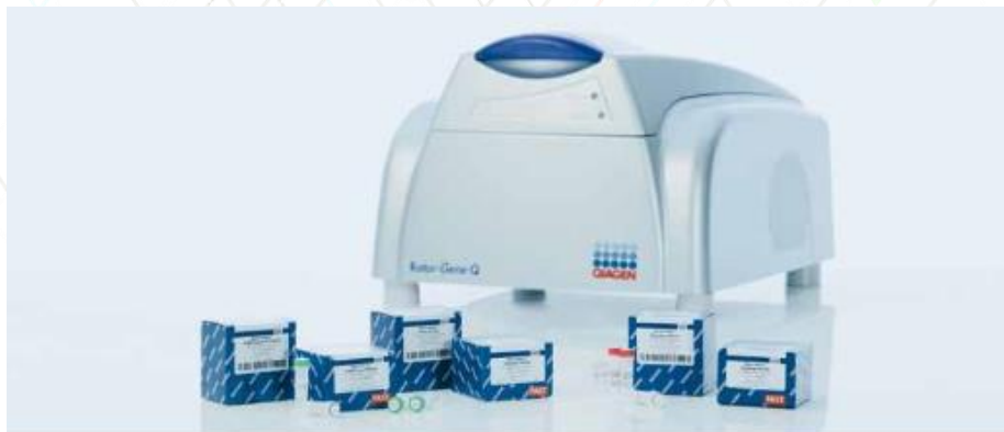
Real-time PCR thermal Cycler : 40 cycles in 45-60 min