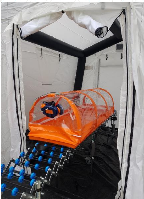
Safe and secure patient isolation and transport of an infected or contaminated patient