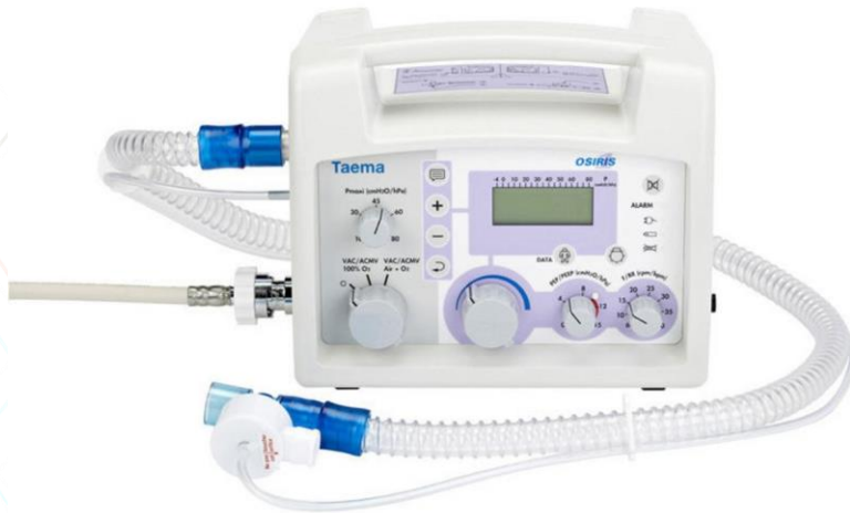
Ventilator for Emergency - Transportation - Inter-hospital transportation. Post-operative recovery